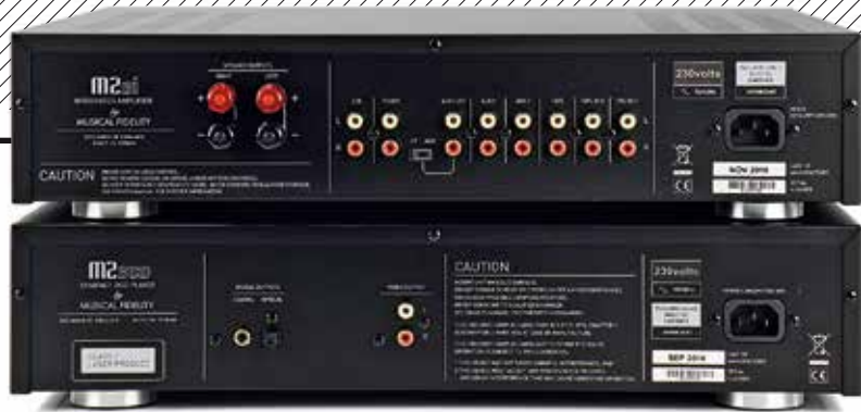
ABOVE: Five line inputs, a tape loop and pre outputs join single sets of (switched) 4mm speaker cable terminals on the amplifier [top]. The CD player [bottom] has no digital inputs – just analogue output on RCA and S/PDIF out on coax and optical

during the main refrain of the chorus where her voice is split in two so that she provides her own backing vocal. It was also a delight to hear the supporting piano rendered so beautifully. The piano is a tricky instrument to reproduce well, but these two components did a superb job when faced with the task.