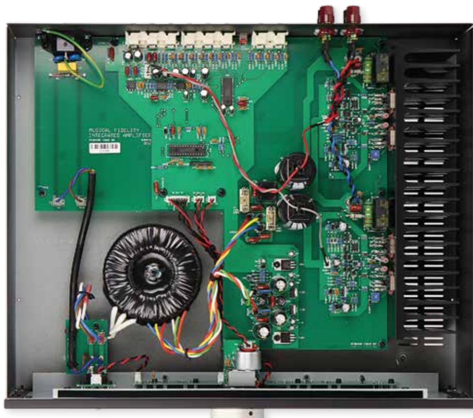
RIGHT: The M2si includes a toroidal transformer and linear PSU [lower left and centre] feeding a discrete output stage with one pair of devices per channel [on heatsink, far right]. Note motorised volume control [bottom]

Both components are user-friendly. The amplifier powers up without drama – a soft click after five or so seconds disables the muting relay and it's ready to go. The CD player's slot-loading mechanism is a very smooth operator and takes and returns the disc in a delightfully 'polite' manner.